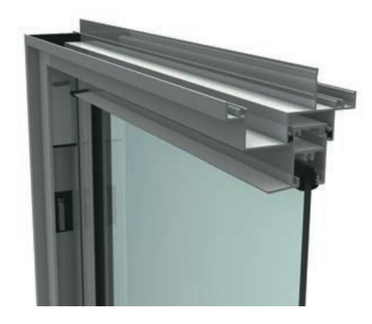
Easy take out clips on side jambs for removal of sash.